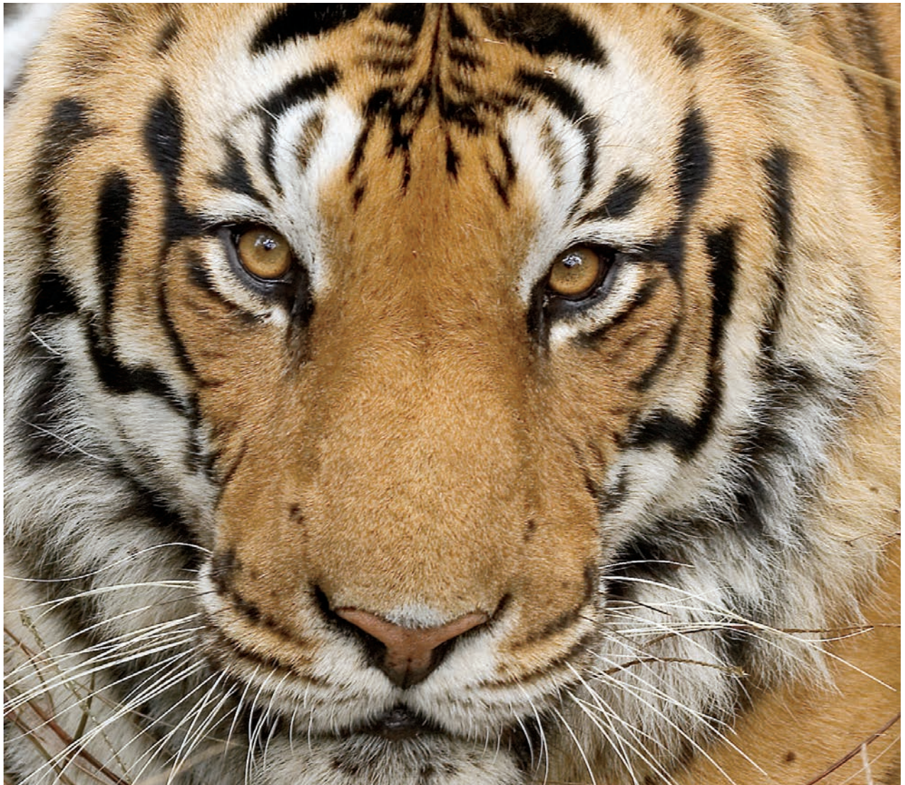
Tiger, Kanha National Park, India

Copyright © 2017 Massachusetts Medical Society.